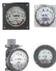
Flush, Surface or Pipe Mounted

A single case size is used for most models of Magnehelic® gages. They can be flush or surface mounted with standard hardware supplied. With the optional A-610 Pipe Mounting Kit they may be conveniently installed on horizontal or vertical 1-1/4" - 2" pipe. Although calibrated for vertical position, many ranges above 1" may be used at any angle by simply re-zeroing. However, for maximum accuracy, they must be calibrated in the same position in which they are used. These characteristics make Magnehelic® gages ideal for both stationary and portable applications. A 4-9/16" hole is required for flush panel mounting. Complete mounting and connection fittings plus instructions are furnished with each instrument.